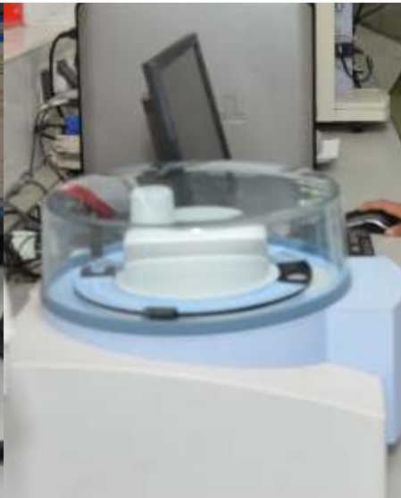
PERKIN ELMER DSC